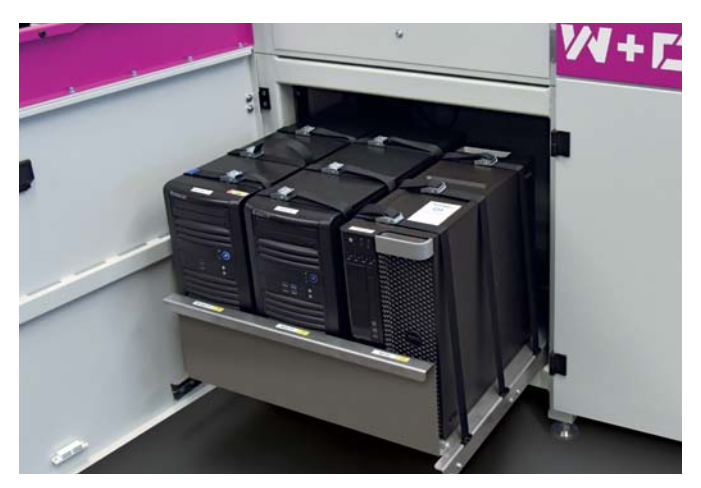
Powerful RIP, data transfer and print head control